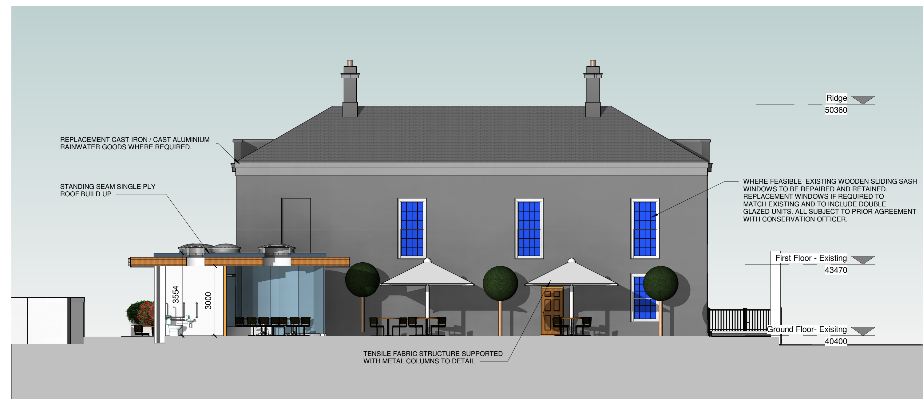
3 Proposed Elevation - North 1 : 100