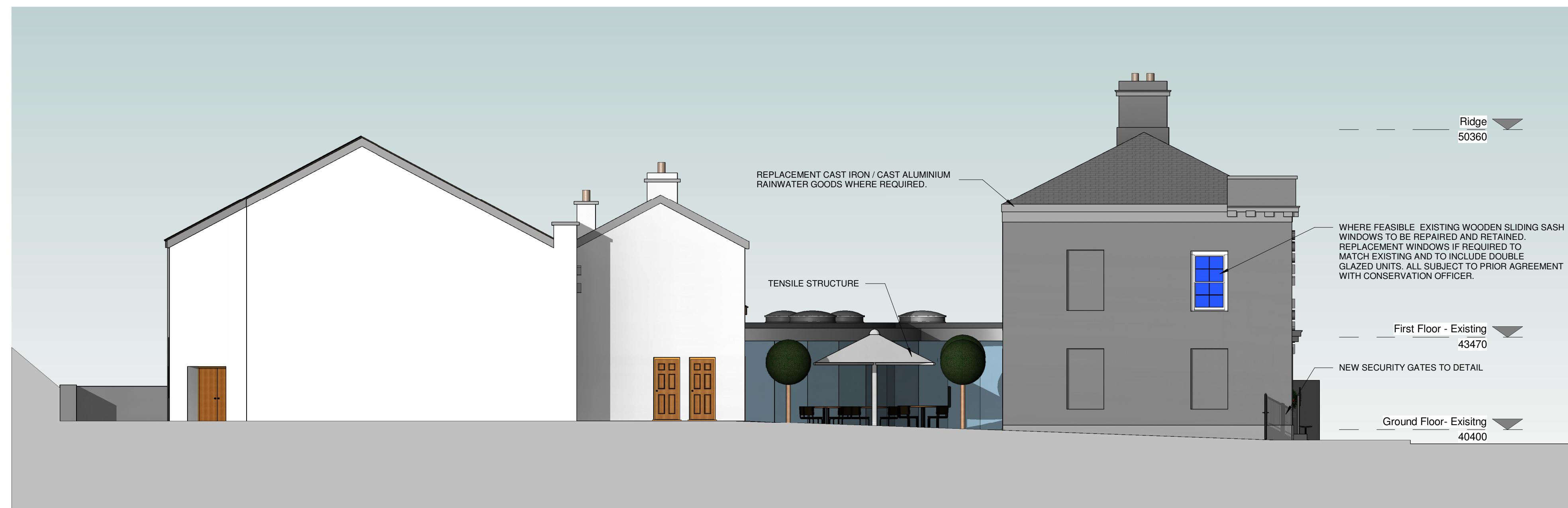
1 Proposed Elevation - West 1 : 100

NO WORKING DIMENSIONS TO BE SCALED FROM DRAWINGS, USE WRITTEN DIMENSIONS ONLY. IMPERIAL DIMENSIONS IF SHOWN, ARE FOR ILLUSTRATIVE PURPOSES ONLY. CONTRACTORS MUST VERIFY ALL DIMENSIONS ON SITE BEFORE WORK COMMENCES. THIS DRAWING IS NOT FOR CONSTRUCTION PURPOSES UNLESS SPECIFICALLY STATED. THIS DRAWING & DESIGN IS COPYRIGHT AND THE PROPERTY OF GALWAY COUNTY COUNCIL. ALL CONTRACTORS AND SUB CONTRACTORS ARE RESPONSIBLE FOR ENSURING COMPLIANCE WITH CURRENT BUILDING REGULATIONS & CODES OF PRACTICE AND FOR TAKING AND CHECKING ALL DIMENSIONS & LEVELS ASSOCIATED WITH THE WORKS. ALL STRUCTURAL ELEMENTS OF THE PROPOSED WORKS MUST BE DESIGNED BY A STRUCTURAL ENGINEER AND BUILT IN ACCORDANCE WITH THEIR DETAILS & SPECIFICATIONS. IF THE DRAWINGS CONTAIN DISCREPANCIES IN RELATION TO OTHER RELEVANT DOCUMENTS, THIS SHALL BE BOUGHT TO THE ATTENTION OF THE CONSULTANTS. IF IN DOUBT ASK @