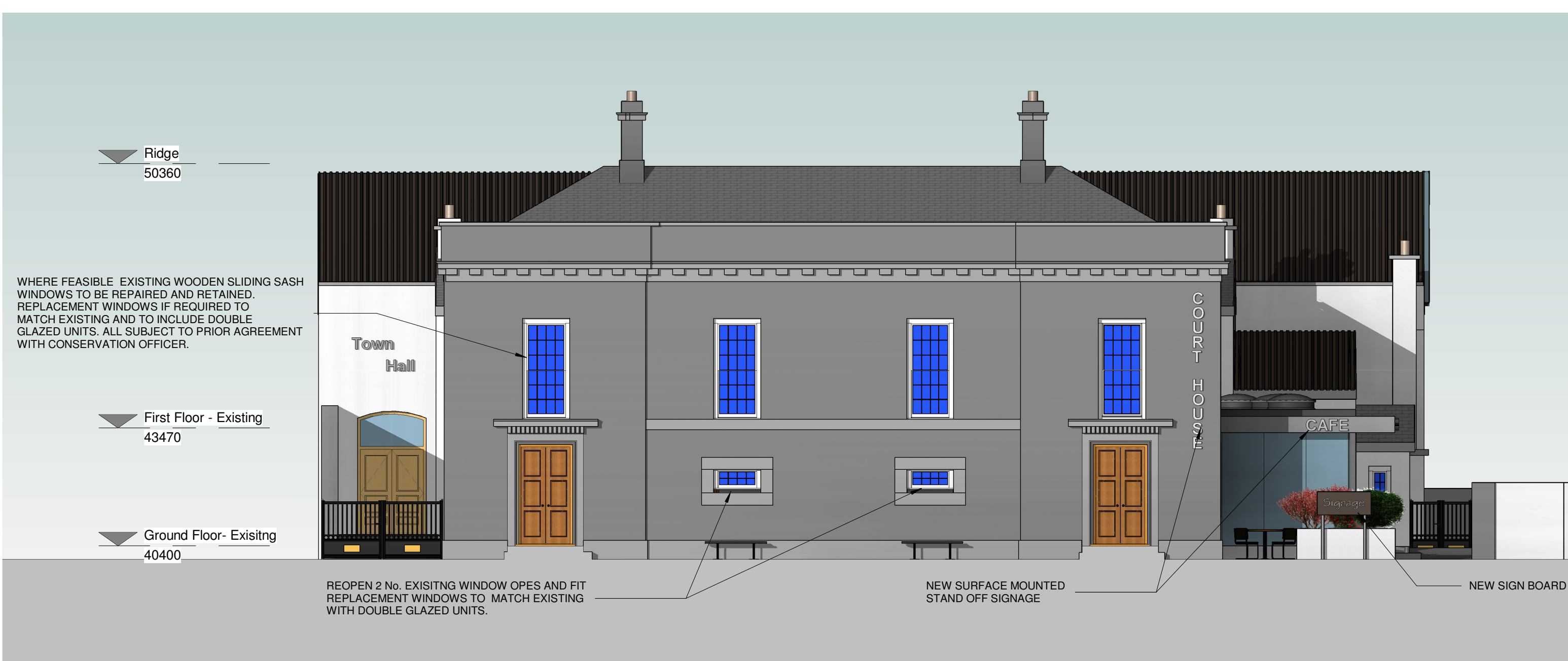
2 Proposed Elevation - South 1 : 100